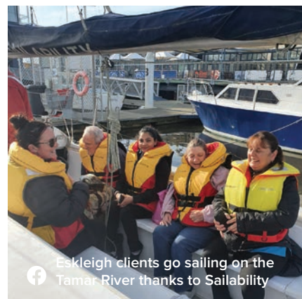
Eskleigh clients go sailing on the Tamar River thanks to Sailability

continue to represent the majority of Eskleigh's expenses, being 75% of operating income in 2020-2021 and 66% in 2019-2020. Eskleigh invested heavily in staffing the Shared Services & Administration area in 2020-2021 to build a hub of expertise to fully support the staff and the organisation in areas such as quality, training, purchasing and behavioural/clinical. The remaining operating expenses remained in line with growth demonstrating Eskleigh's strong cost controls.