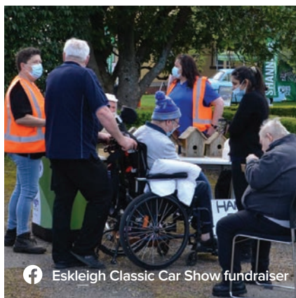
Eskleigh Classic Car Show fundraiser

The result for financial year 2020-2021 is due to a range of factors showing an increase in both revenue and associated costs; Continuity of Support funding continues at NDIS equivalent levels; and greater understanding of the NDIS is enabling further support to participants. Operating income increased by 14.5%, however employment costs increased by